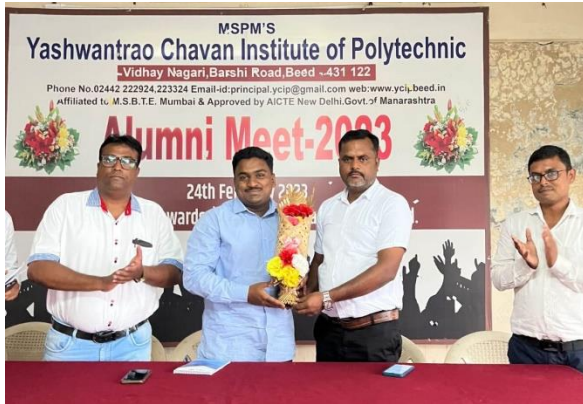
Figure 1: Felicitation of Dignitaries