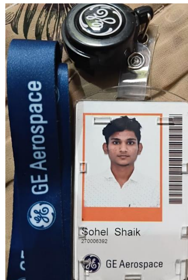
Figure 3: GE Aerospace Pune