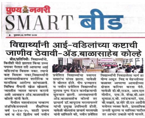
Figure 1: News Published (25/09/2024)