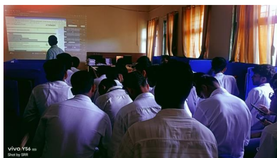
Figure 2: Student Joined via Smart Classroom