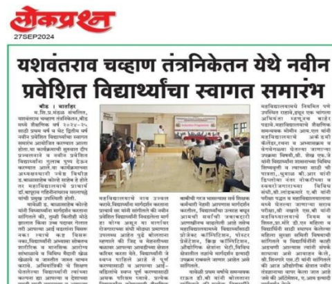
Figure 2: News Published (27/09/2024)