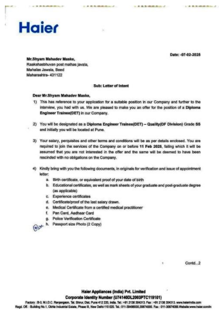
Figure 3: Haier India Pvt Ltd Pune