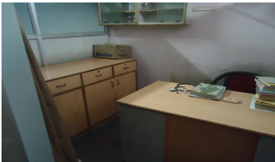
MEDICAL & OTHER FACILITIES AT HOSTEL