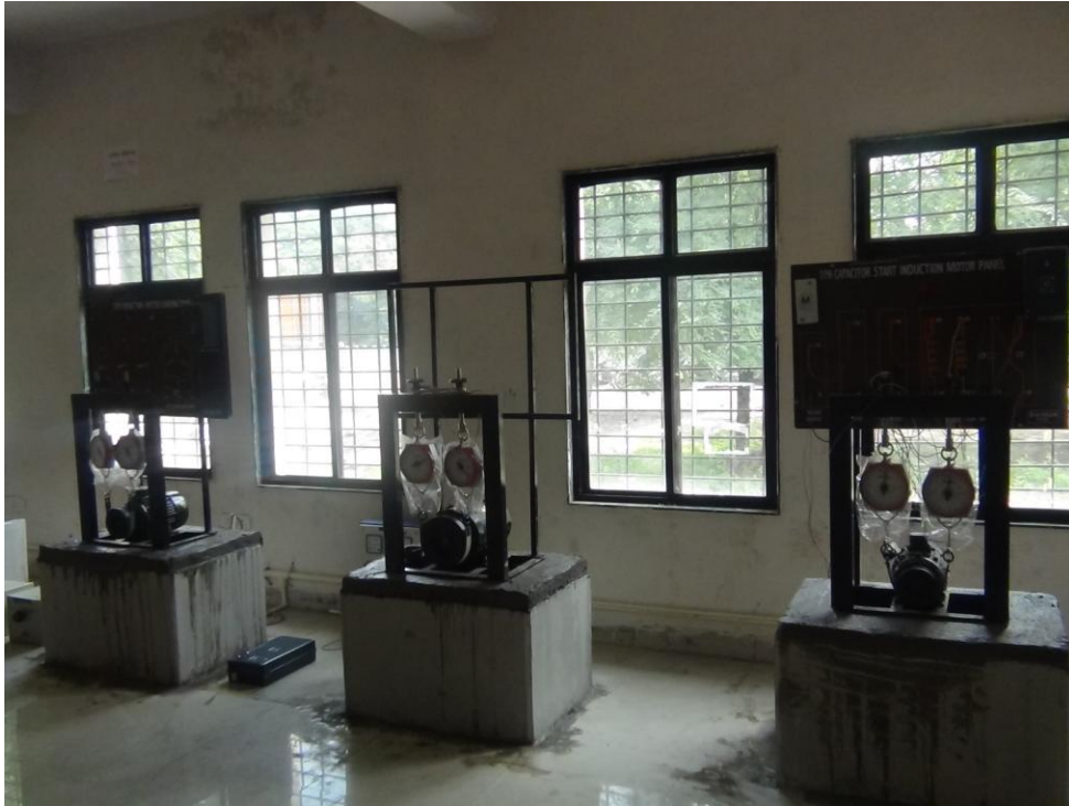
DC MACHINE LAB