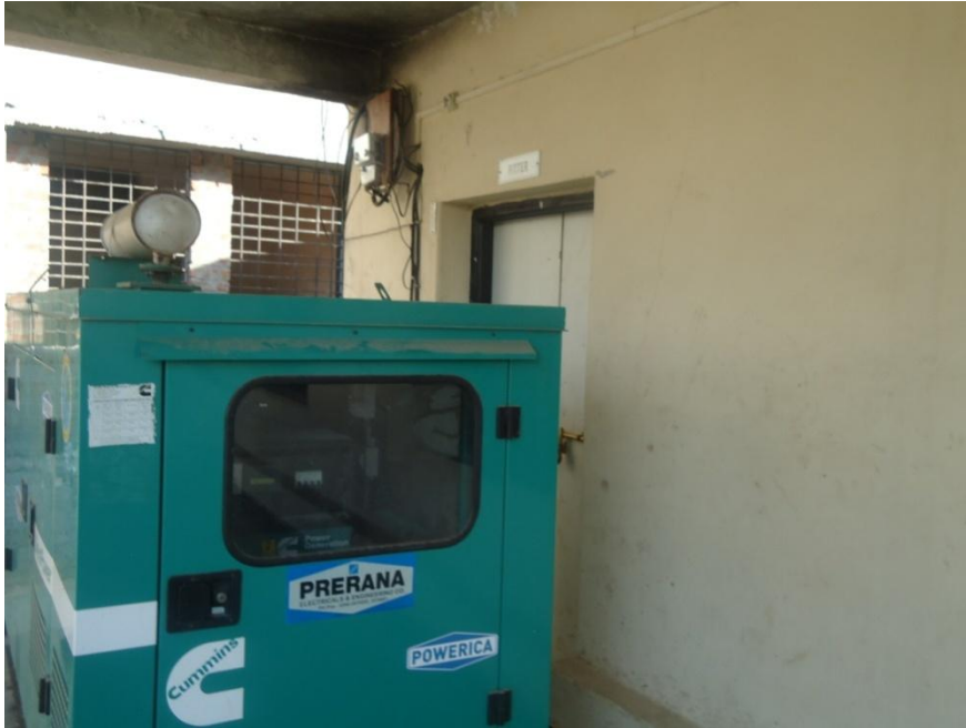
GENERATOR OF 25KVA